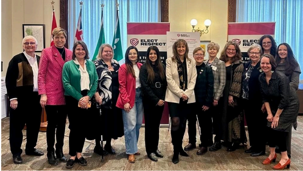
Elect Respect Representatives, led by Marianne Meed Ward, Mayor of Burlington.

The EOWC was pleased to join Elect Respect at Queen's Park for their advocacy day, standing in support of respectful and inclusive public service. The day provided a valuable opportunity to connect with leaders and reinforce a shared commitment to fostering safe, respectful environments for all.